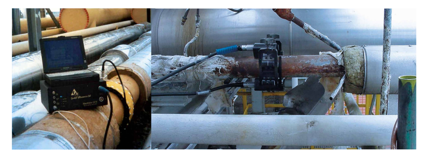
Fig. 3: Guided wave technology applied on pipe racks

Guided waves technology can be affected by signal attenuation, which directly influences the length of pipe which can be inspected. The causes for signal attenuation arise from several sources including: material attenuation, due to using high-loss coatings such as bitumen as insulation material; scattering that may be produced by general corrosion; signal reflections from features such as welds and clamps; or mode conversion at bends and branches.