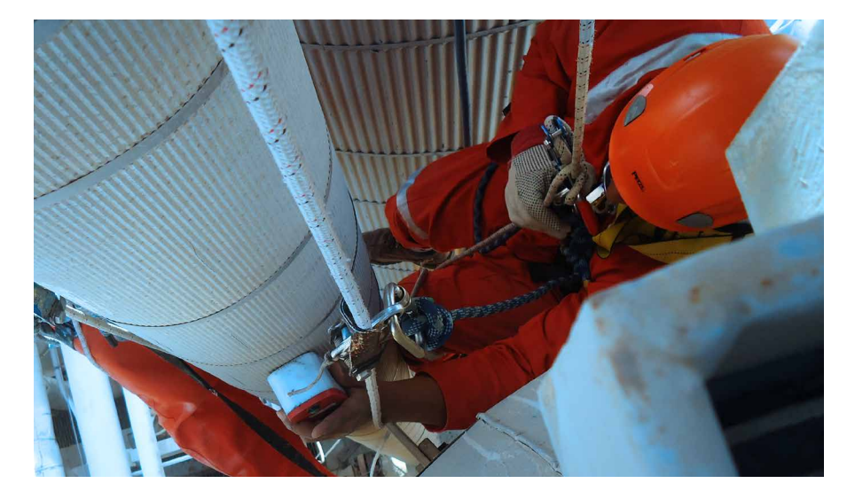
Fig. 1. PEC CUI examination of a vertical pipe using rope access operator to cut down scaffolding costs and reduce preparation time to access the object

objects without removing the insulation and without any object surface preparation. The technology is characterized by its extensive penetration depth and relatively low sensibility to lift-off. PEC is a complementary solution to other NDT solutions for CUI and has been used in a number of different applications, including the detection and measurement of corrosion under fire-proofing (CUF) in skirts of process columns, in the support legs of spherical storage tanks, and on various types of insulated pipes and vessels in on- and offshore installations. Most of these objects are insulated and water ingress may cause corrosion underneath the covering. The deterioration process cannot be seen from the outside. Using PEC to indicate the affected areas can lead to significant cost reduction, especially because this non-intrusive inspection method may be applied on stream and far before a turnaround has to be performed. This approach assists the prioritization and efficient planning of all related turnaround activities helping reduce risks, shorten task duration and minimize installation downtime. Companies like Shell also rely on this technology for CUI protection and assessment programs.